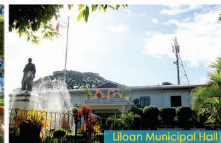
Liloan Municipal Hall