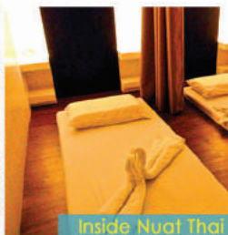
Inside Nuat Thai