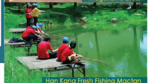
Han Kang Fresh Fishing Mactan