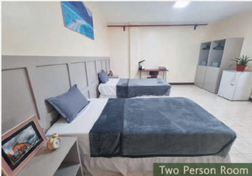
Two Person Room