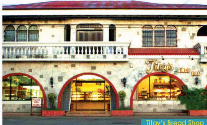
Titay's Bread Shop