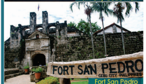
Fort San Pedro