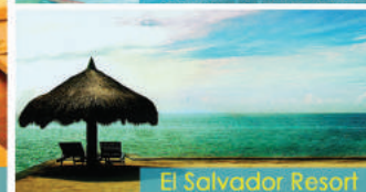
El Salvador Resort