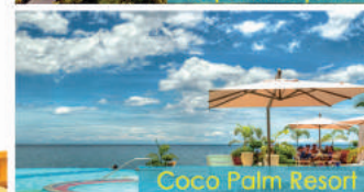
Coco Palm Resort