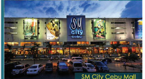
SM City Cebu Mall