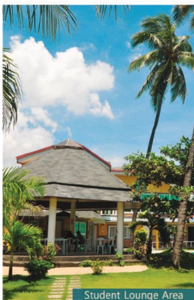
Student Lounge Area

CJ is located in Liloan City, a quiet and safe suburb of Cebu City. The campus looks and feels like a resort: you can see the ocean horizon right at the 2nd floor of the campus. The environment around our Campus is clean, quiet, and relaxing. It's the perfect place to recuperate and relax after a day of focused study.