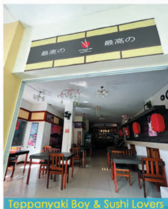
Teppanyaki Boy & Sushi Lovers

CIJ Campus is located beside the sea. Feel the fresh air as you stroll through the landscaped garden - a perfect environment for students to relax and study in.