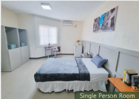
Single Person Room

CIJ is a resort-style academy located nearby the sea. Every room in the campus has a magnificent view and fresh sea air. Second floor dormitory has an ocean view while the ground floor dormitory has a garden view.