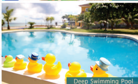
Deep Swimming Pool