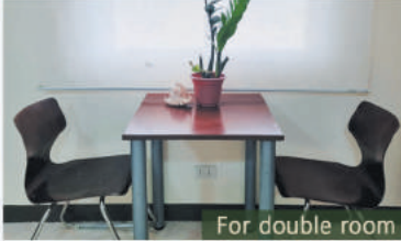
For double room