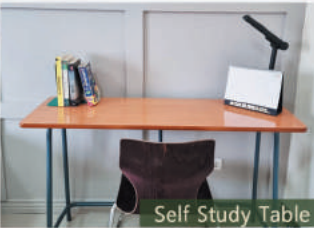
Self Study Table