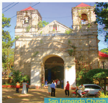
San Fernando Church