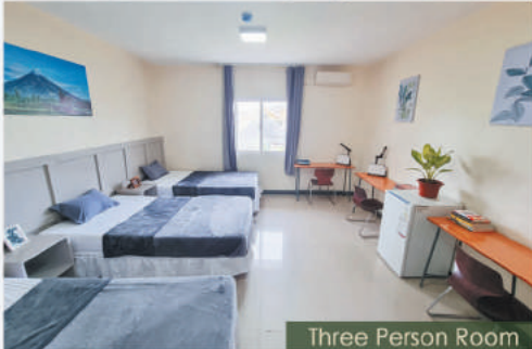
Three Person Room