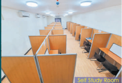
Self Study Room