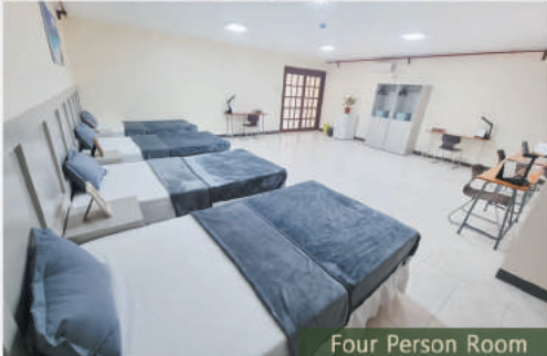
Four Person Room