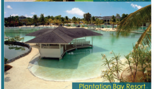
Plantation Bay Resort